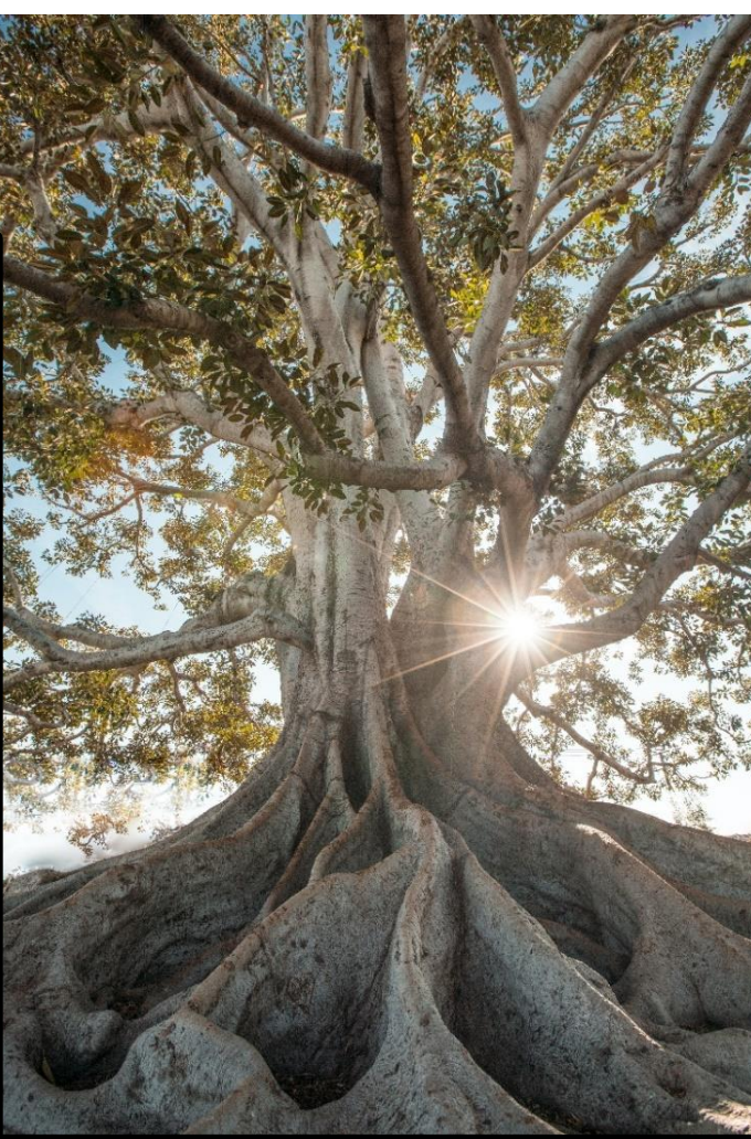
Faith is the roots of